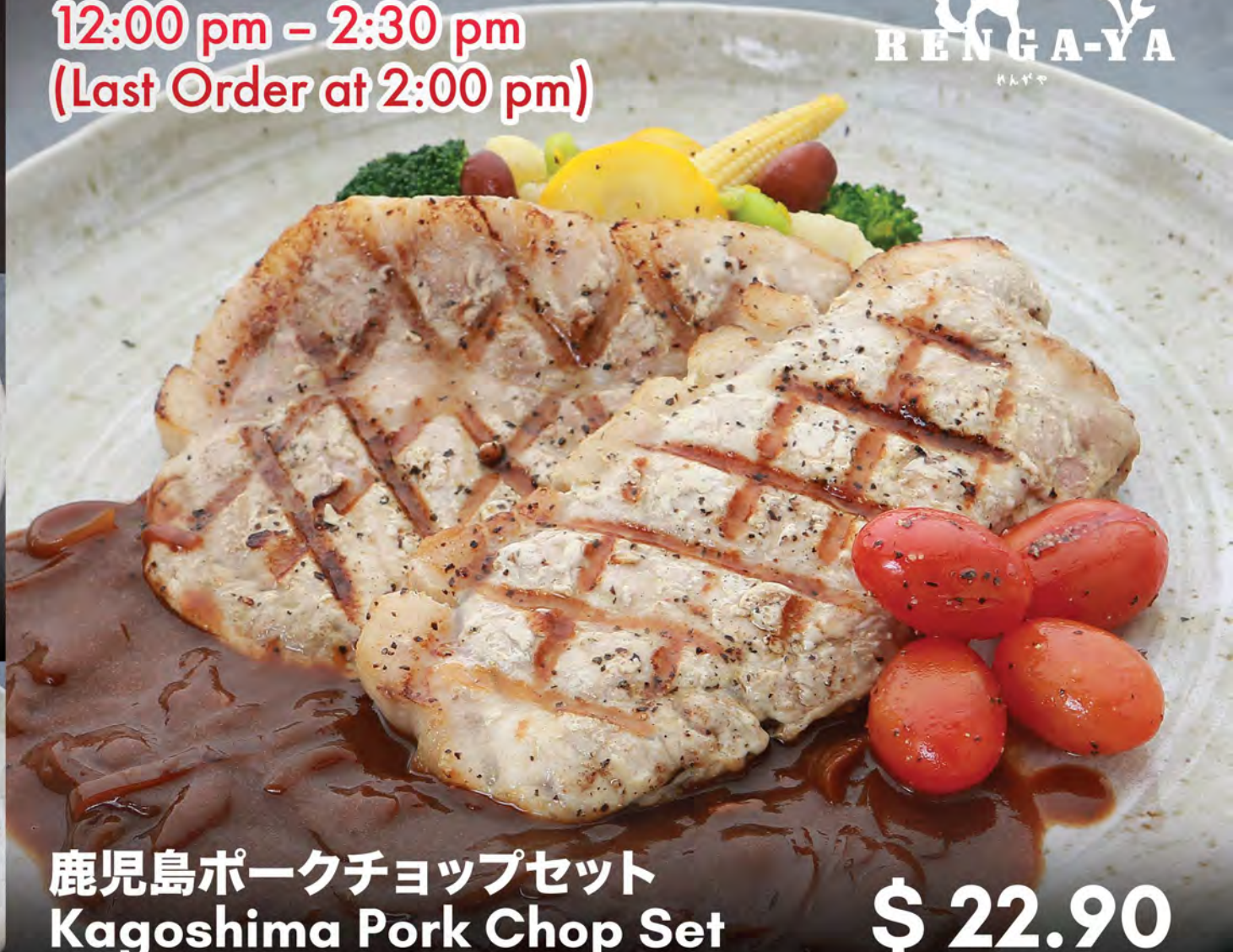
鹿児島ポークチョップセット Kagoshima Pork Chop Set $ 22.90 Grilled Japanese Pork Chop with Demi Glacé Sauce