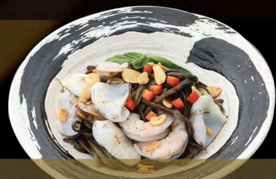
イカ墨シーフードパスタセット Squid Ink Seafood Pasta Set $ 17.90 Mixed Seafood Squid Ink Linguine

All prices are subject to 10% service charge & prevailing government taxes. Food images shown are for illustration purposes only and may not represent the actual food served.