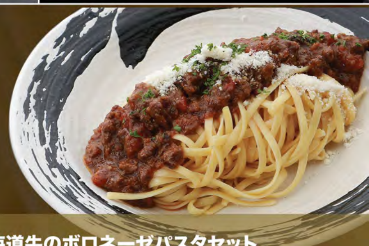
北海道牛のボロネーゼパスタセット Hokkaido Beef Bolognese Pasta Set $ 18.90 Slow Cooked Japanese Prime Beef with Red Wine on Linguine