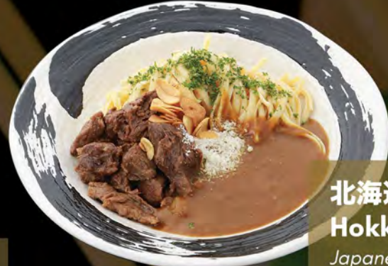
北海道ビーフカレーパスタセット Hokkaido Beef Curry Pasta Set $ 19.90 Japanese Prime Beef Curry Linguine