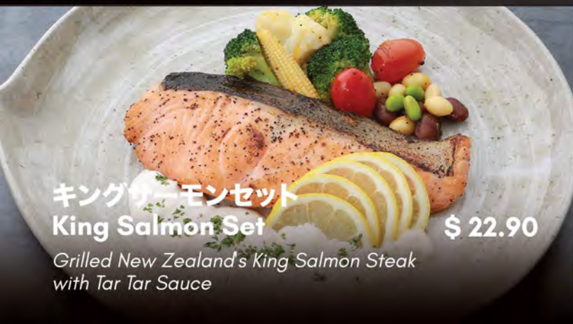
キングサーモンセット King Salmon Set $ 22.90 Grilled New Zealand's King Salmon Steak with Tar Tar Sauce