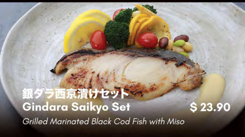
銀ダラ西京漬けセット Gindara Saikyo Set $ 23.90 Grilled Marinated Black Cod Fish with Miso