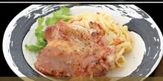
チキンチョップパスタセット Chicken Chop Pasta Set $ 16.90 Spicy Aglio Olio Linguine topped with Chicken Chop & Black Pepper Sauce